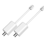
LR1002 EoC Passive Converter