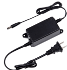
DH-PFM321D-US Power Adapter