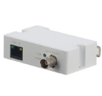
LR1002-1EC Single-port EoC Receiver